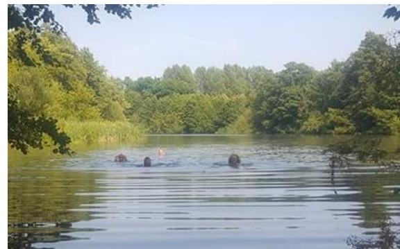
The Welsh Colleges Open Water Unsynchronised Swimming Team practising on the Summer Tour

Kent was the destination for the Summer Cycling Tour. For once, Summer meant Summer and there was much sweating whilst cycling, followed by necessary rehydration.