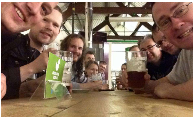
Society members at the Green Duck Brewery.

The Easter tour featured a memorable visit to the Green Duck Brewery in Stourbridge, as well as a day travelling between towers on the Severn Valley Railway.