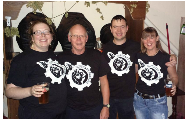
The Master and Social Secretary with friends at the Hopcraft brewery.