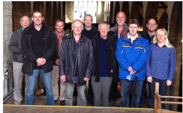
The band that rang the peal of Isleworth S Royal

Tour as the hills took their toll. The Denmisch ring in Okehampton provided us with not only the novelty value of the Saxilby Simulators, but also refreshments that were welcomed after a hard day's cycling.