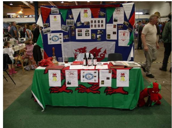
The stall at the Ringing Roadshow.

members ringing their first peal with the Society, including some first-pealers.